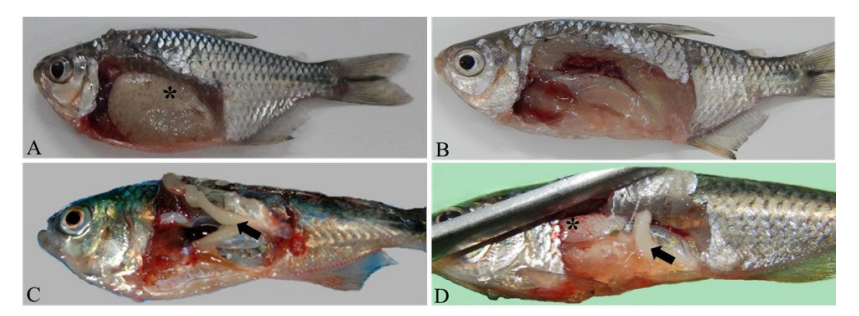
Figure 1. Representation of sexual classification based on primary characters for (A) female (*- ovary), (B) indeterminate, (C) male (arrow- testis) and (D) intersex (*- ovary and arrow- testis) of yellowtail tetras ( Astyanax lacustris ) treated with different concentrations of the masculinizing hormone 17α-methyltestosterone supplemented in the feed.

For the 30 individuals from each treatment that had their gonads evaluated, it was possible to identify males, females, intersex, and indeterminate individuals (Figure 1). In the control treatment, 46.7% of males and 53.3% of females were observed, while in the MT treatments the percentage of males ranged from 50% (40 mg/kg) to 76.7% (20 mg/kg) and females varied from 3.3% (20 mg/kg and 60 mg/kg) to 46.7% (40 mg/kg) (Table 2). Individuals with intersex gonads were observed in the 20 and 60 mg/kg treatments and individuals with undifferentiated gonads were observed in all MT treatments. Gonads at different stages of development (from immature through spawning capable, Araújo et al., 2019) were observed in all treatments (Figure 2). There was a significant difference (P < 0.05) between the frequencies of males and females found in the 20 and 60 mg/kg MT treatments and in the control (Table 2).