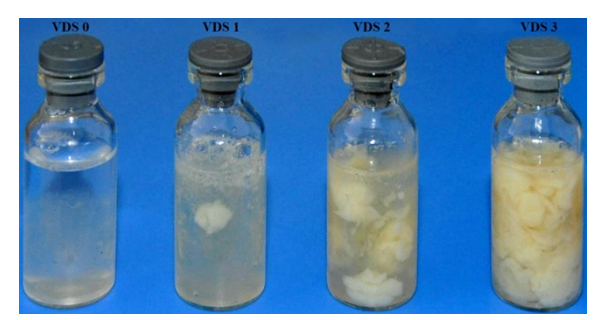
Figure 1. Typical samples of vaginal mucus character score. VDS 0: no or clear mucus; VDS 1: discharge containing flecks of white or off-white pus; VDS 2: discharge containing less than 50% white or off-white mucopurulent pus; and VDS 3: discharge containing more than 50% white or yellow purulent pus.

To determine the impact of CE on reproductive performance, according to the vaginal mucus character scores (Figure 1), cows were allocated randomly into six groups: nonendometritis with VDS 0 (control; CON group); non-treated, mild endometritis with VDS 1 (MEM group); treated, mucopurulent endometritis with VDS 2 (TME group); non-treated, mucopurulent endometritis with VDS 2 (NTME group); treated, purulent endometritis with VDS 3 (TPE group); and non-treated, purulent endometritis with VDS 3 (NTPE group). Clinically healthy cows with VDS 0 received no placebos. Cows with VDS 1 received no further treatment. Cows with VDS 2 or 3 were subdivided into subgroups: one was treated with intrauterine infusion of 200 mL of 50% dextrose solution (Sheng'Ao Animal Pharmaceutical Co., Ltd. Shanxi, China), whereas the other subgroup was treated without intervention. The details of the treatment protocol of dextrose and its effects were reported elsewhere (Brick et al., 2012; Maquivar et al., 2015; Ahmadi et al., 2019). After 14 days therapy, vaginal discharge was reevaluated at 40 \pm 3 DIM using the same VDS grading system previously described. Cows that had no or clear mucus discharge (VDS 0) were considered to recover from CE. After treatment and re-evaluation, all cows followed the normal herd reproductive management practices in the breeding period.